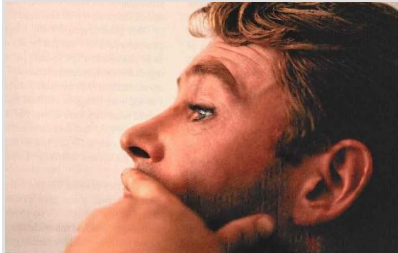
Kirkland, n.d., Peter O'Toole .

When a copy of the artwork is included in your work.