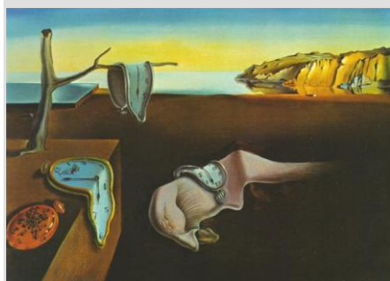
Dali, 1931, The persistence of memory .

When a copy of the artwork is included in your work.