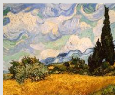
Figure 2. Van Gogh, 1889, Wheat field and cypress trees .