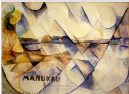
McCahon, 1954, Manakau .

When a copy of the artwork is included in your work.